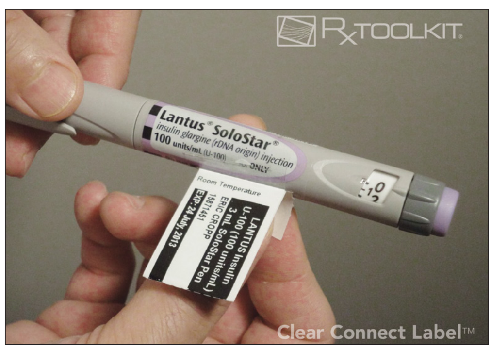
The label format and adhesive sleeve are designed to display all the information required to safely dispense and use the insulin pen without obscuring the manufacturer label.

use of all upper case letters for the patient, all lower case letters for the dispensing pharmacist, and two forms of patient ID.